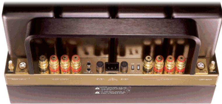
Rear view of connector panel. Metal arch serves as a handle.

Balanced and unbalanced inputs 24-ct. gold-plated input jacks 24-ct. gold-plated 200-ampere multi-way output binding posts 24-ct. gold-plated handles and knob trim rings 24-ct. gold-plated identification plaque Illuminated peak-responding wattmeters with hold Remote power control connection to McIntosh Control Centers and Preamplifiers Removable cage cover for tubes Stainless-steel chassis with titanium gold mirror finish Glass front panel with illuminated nomenclature Certificate of authenticity showing production number and total build quantity (sent by mail)